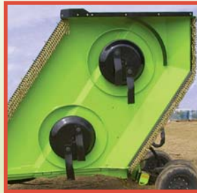
- Pan unit with stump jumpers -