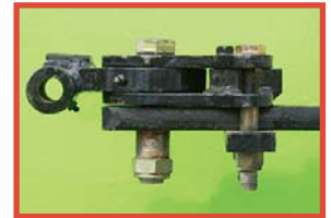
- Precision Hitch -