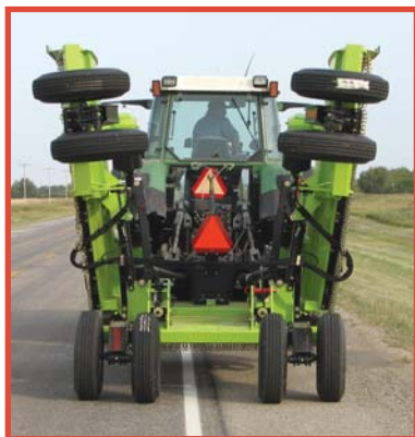
- Narrow Transport Width -