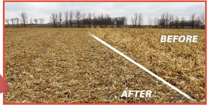
Excellent Shredding and Distribution