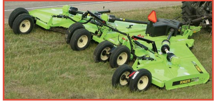
Tandem Walking Axles work great for Highway & Road-side mowing