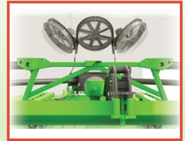
- Optional Deck Debris Fan Kit -