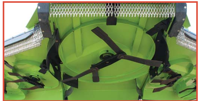
Stationary Fixed Knife system and strategically placed baffles ensure proper chop and spread