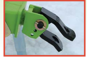
- Open Clevis Hitch -

* Down boxes have 1.75" 20 spline input shafts and 2.375" down shafts.