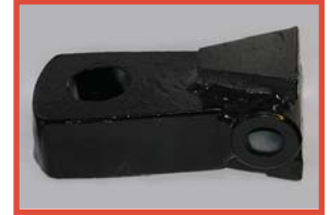
- Solid Tongue Hitch -