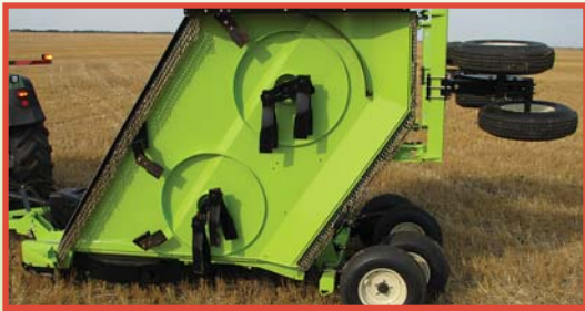
- Fixed Knife unit shown -